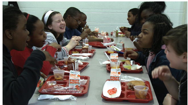
Students eat lunch together at Armstrong Elementary School, which has implemented PBIS.

The study also showed that disciplinary measures are not color-blind. African-Americans were 30 percent more likely to face disciplinary action, often for a similar incident, that would not lead to suspension for a White or Latino student.